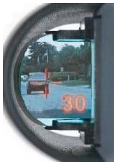
Intelligent HUD rotates AUTOMATICALLY when you use in vertical or horizontal position